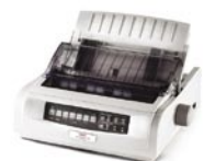
Dot Matrix Printers