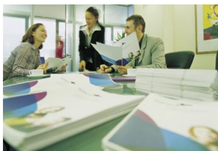
Saddle-stitched customer brochures